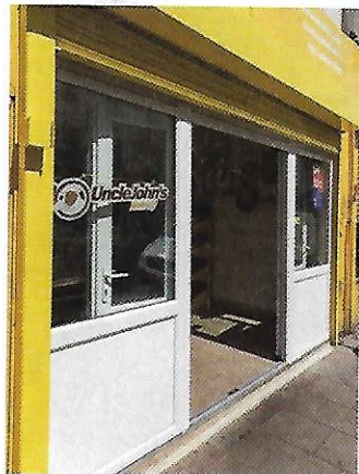
Uncle John's Bakery entrance